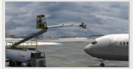
Understand driving patterns required in congested deicing pads