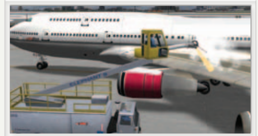
Recognize collision points with aircraft and no-spray zones

Our customers enjoy the best of both worlds because simulators are backed by the resources of a world-leading organization – L-3 – an industry leader of training, simulations and government services.