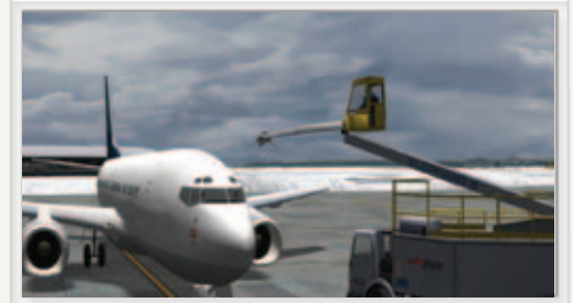
Practice spraying techniques