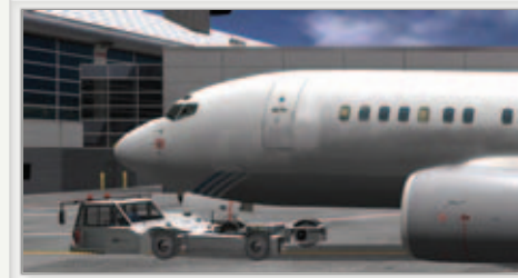
Efficiently train on a towbarless tractor to push or tow