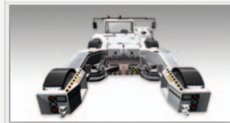
New to the Ramp Portfolio is JBT AeroTech's Expediter towbarless tractor