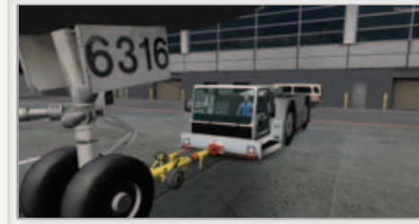
Recognize limits of conventional tractors to avoid shear pin failure and towbar collision